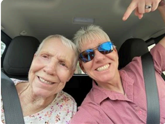
Birthday Haircuts, 2022

Kristen Taylor-Hendges shared 2 photos to the Tribute Wall album. December 28 at 11:40 AM